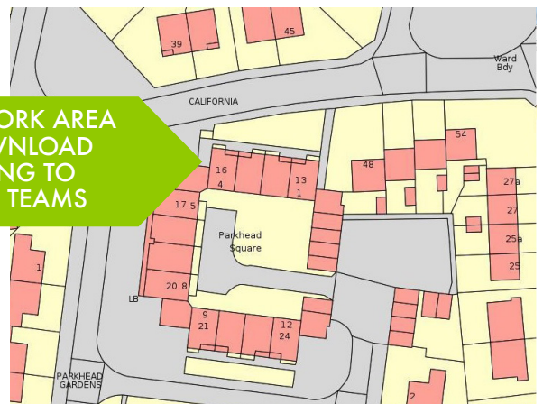
Detailed Ordnance Survey mapping downloaded wirelessly

SELECT WORK AREA TO DOWNLOAD MAPPING TO SURVEY TEAMS